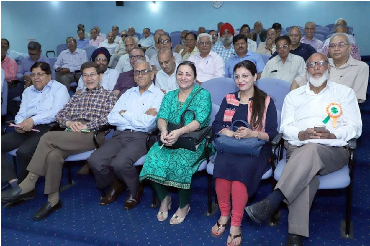
A view of the AGM audience, including 2 Doctors of CGHS Wellness Centre Jammu, as special invitees.