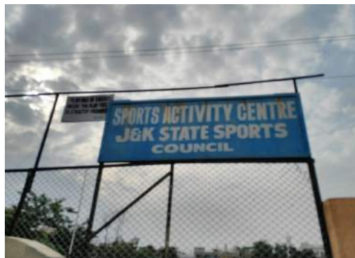
Venue at Gandhi Nagar Jammu for Swachh Bharat Campaign by Association Members on 23 June 2017