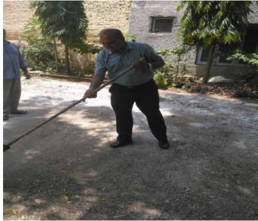
Swachh Bharat Campaign Activity in the premises of J&K Samaj Kalyan Kendra Higher Secondary School For Hearing Handicapped, Shahidi Chowk Jammu.