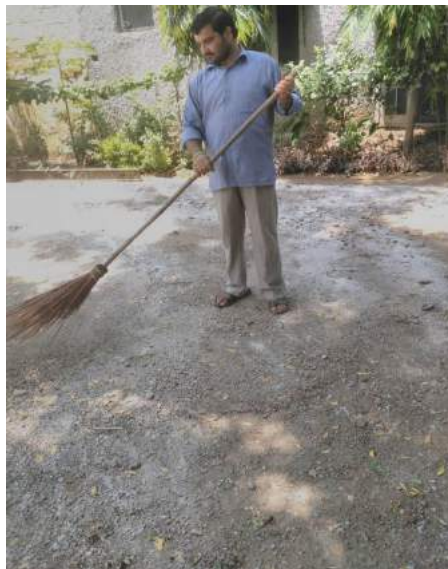
Swachh Bharat Campaign Activity in the premises of J&K Samaj Kalyan Kendra Higher Secondary School For Hearing Handicapped, Shahidi Chowk Jammu.