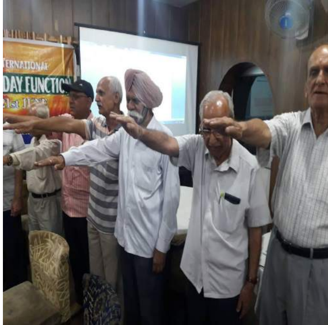
Swachhta Pledge by Association Members in Weekly Meeting at Jammu on 19 June, 2017