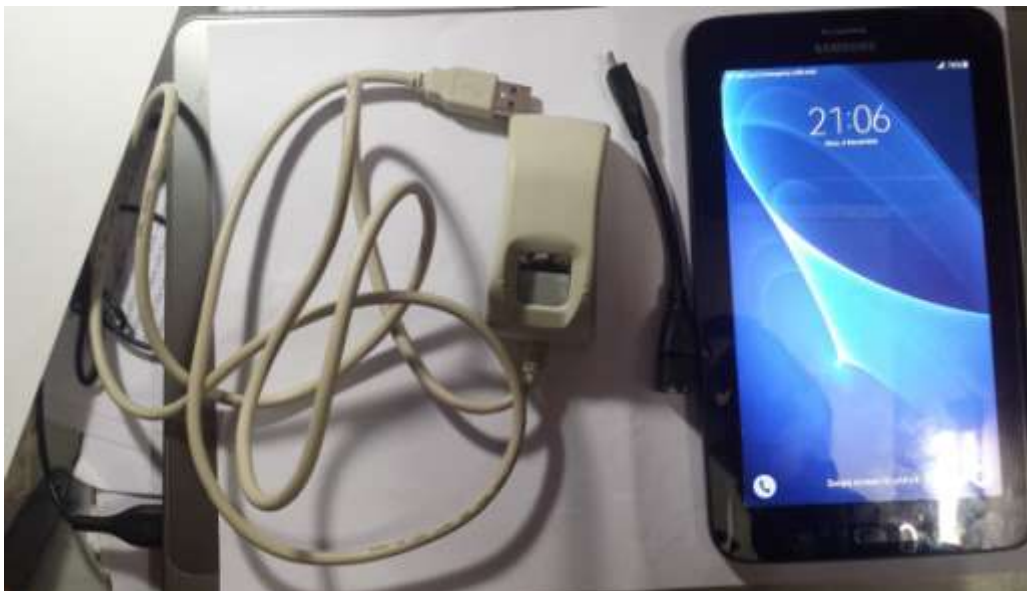
Galaxy Tab Iris compatible with G2 & G3 SIM & Fingerprint Device FM220.