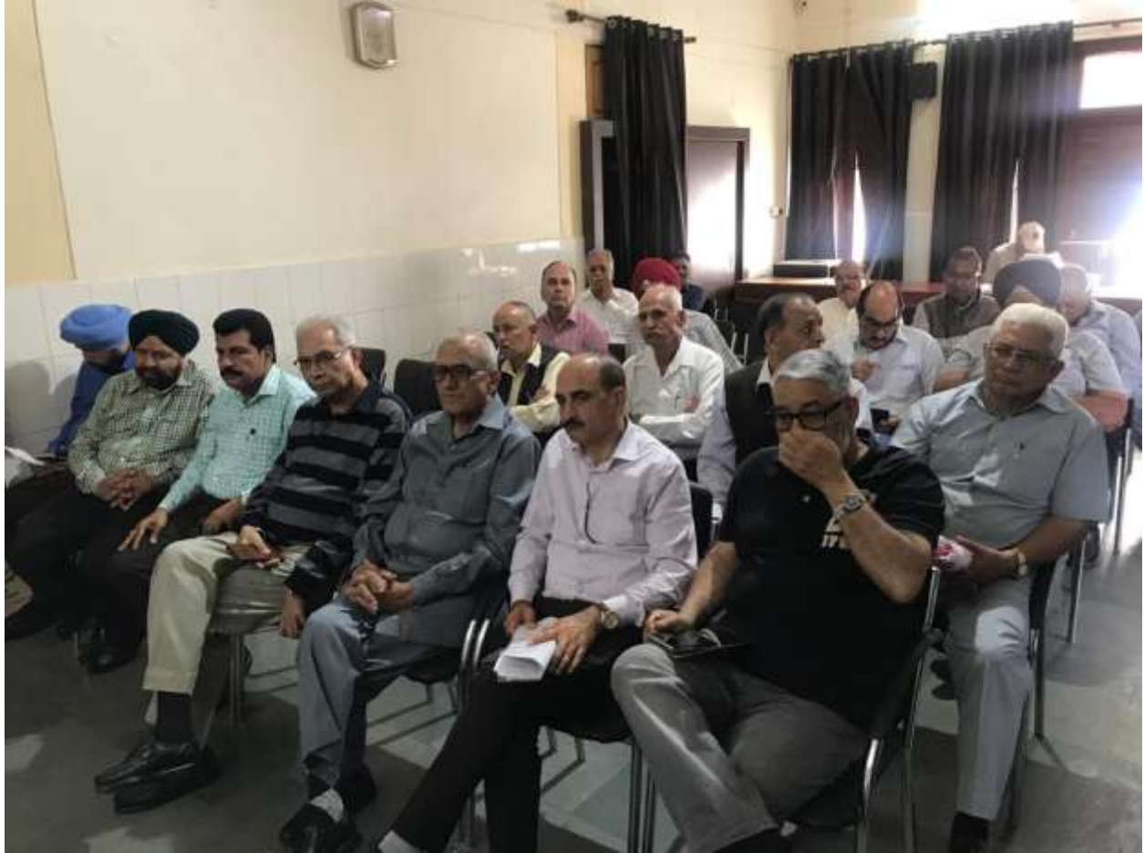
Association Members participating in the demonstration. Queries raised by some members were replied to satisfactorily by the visiting team.