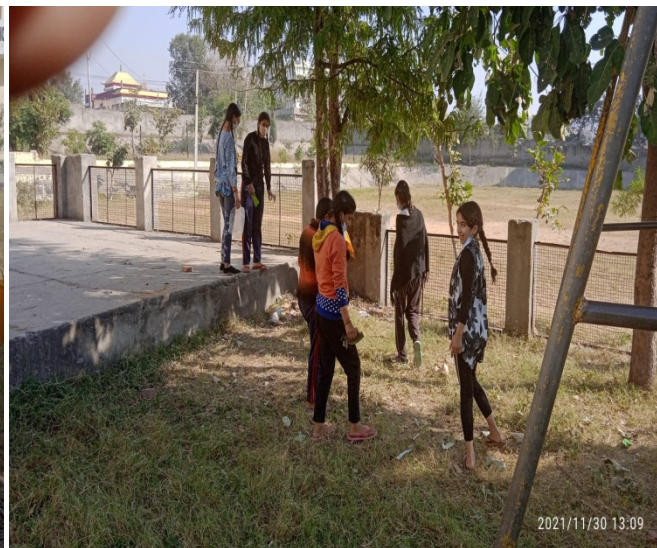
Swachhta Abhiyan by 125 students of BALGRAN Residential School viz. Bal Bharti Public School during Swachhta Pakhwada 2021 in the sprawling 36 kanal premises of Balgran.