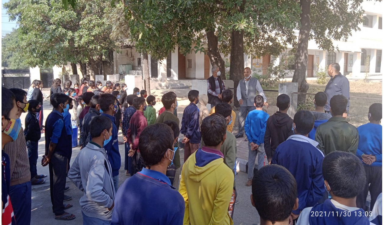
Swachhta Abhiyan by 125 students of BALGRAN Residential School viz. Bal Bharti Public School during Swachhta Pakhwada 2021 in the sprawling 36 kanal premises of Balgran.